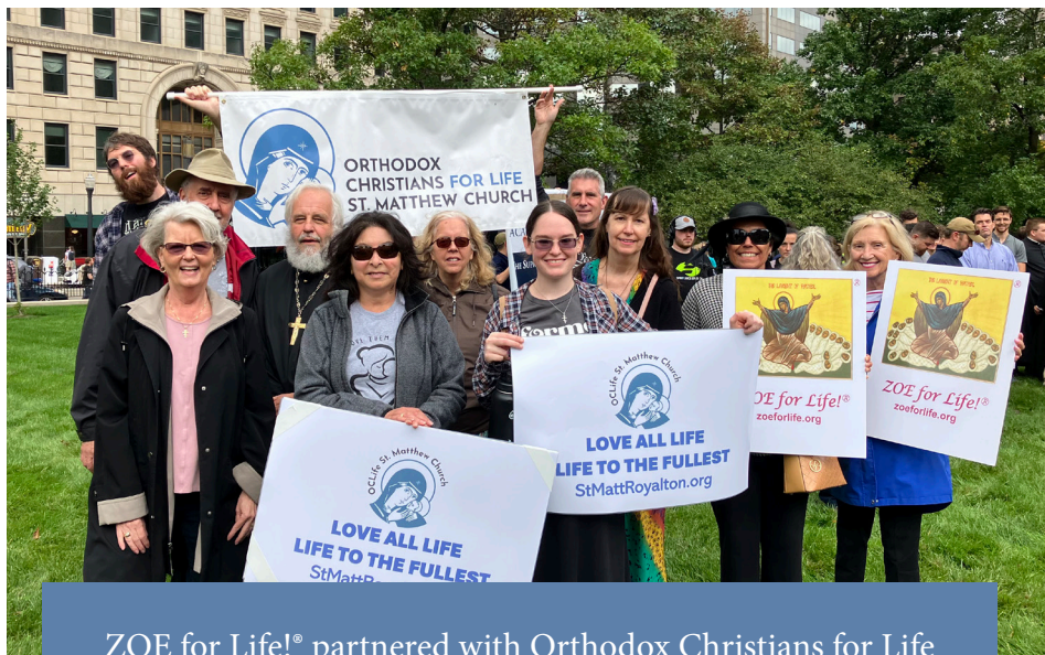
ZOE for Life!® partnered with Orthodox Christians for Life members from St. Matthews Orthodox Church to attend Ohio March for Life.